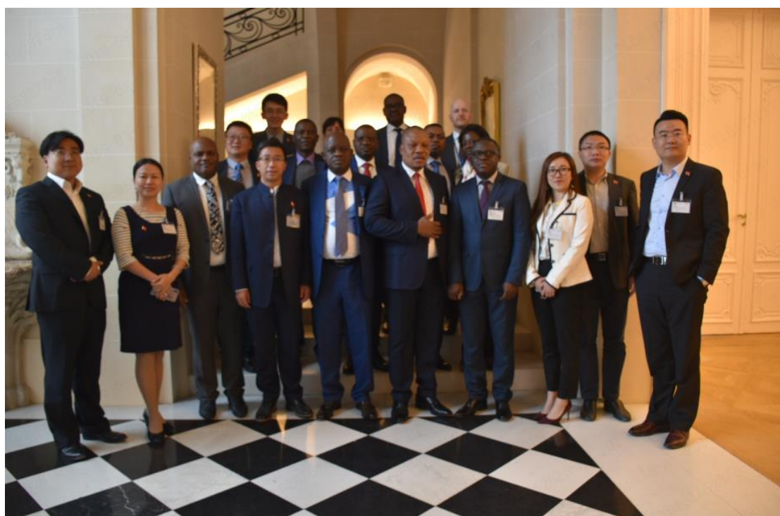
Figure 2 Photo by the Chinese delegation with representatives of the Congolese Ministry of Mines (CATL, right)

CATL has been represented at the 13th responsible Mineral Supply chain Forum, held by the Organization for Economic Cooperation and Development (OECD) in Paris, France, from 26th 23 to April 2019, to conduct further in-depth communication and consultation with the upstream and downstream of the international cobalt supply chain and various stakeholders on the results, issues and recommendations. Through RCI Coordination, the Chinese delegation held bilateral talks with representatives of the Congolese Ministry of Mines, and held consultations on governance and control at the source.