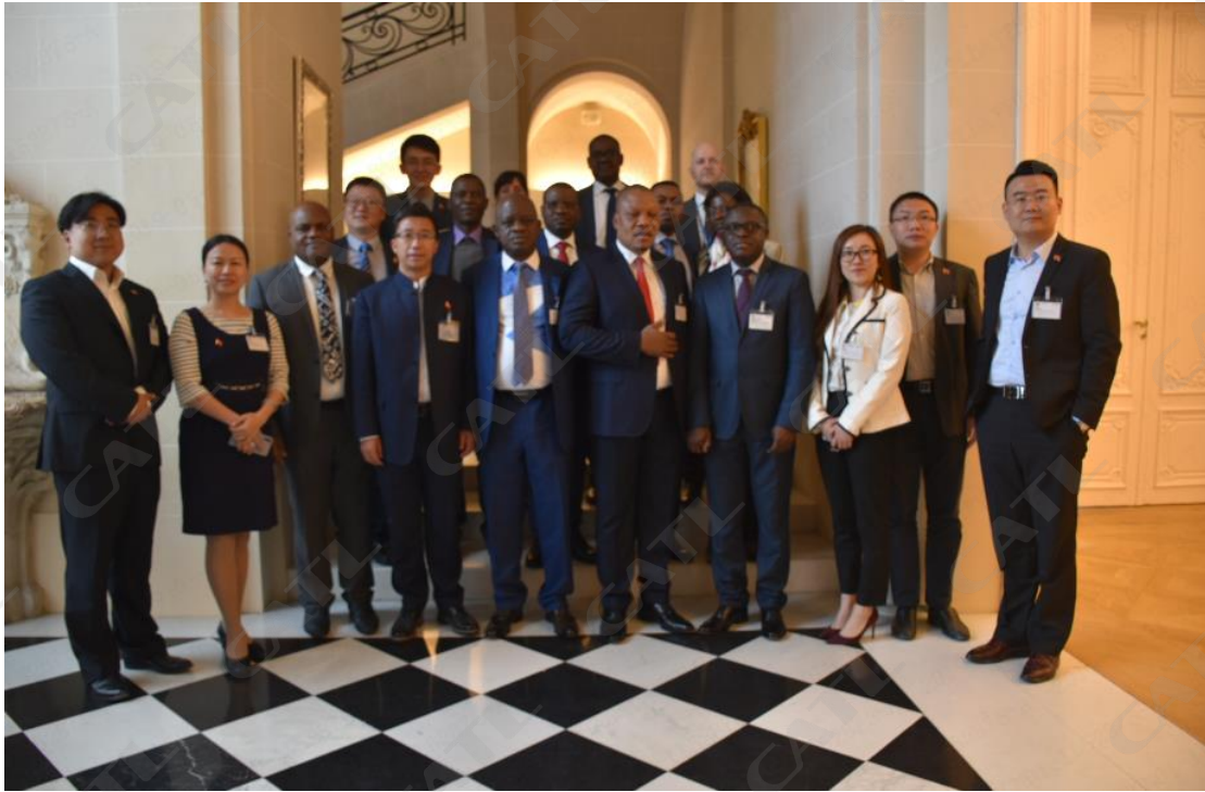
Figure 2 Photo by the Chinese delegation with representatives of the Congolese Ministry of Mines (CATL, right)

This report is a progress report on the cobalt supply chain, to improve the transparency and sustainability of the entire supply chain, CATL is also investigating and analyzing the supply chain of nickel, manganese, lithium, graphite through independent third party audit program. CATL plans to release progress status of other mineral supply chain in the next year' s sustainability report.